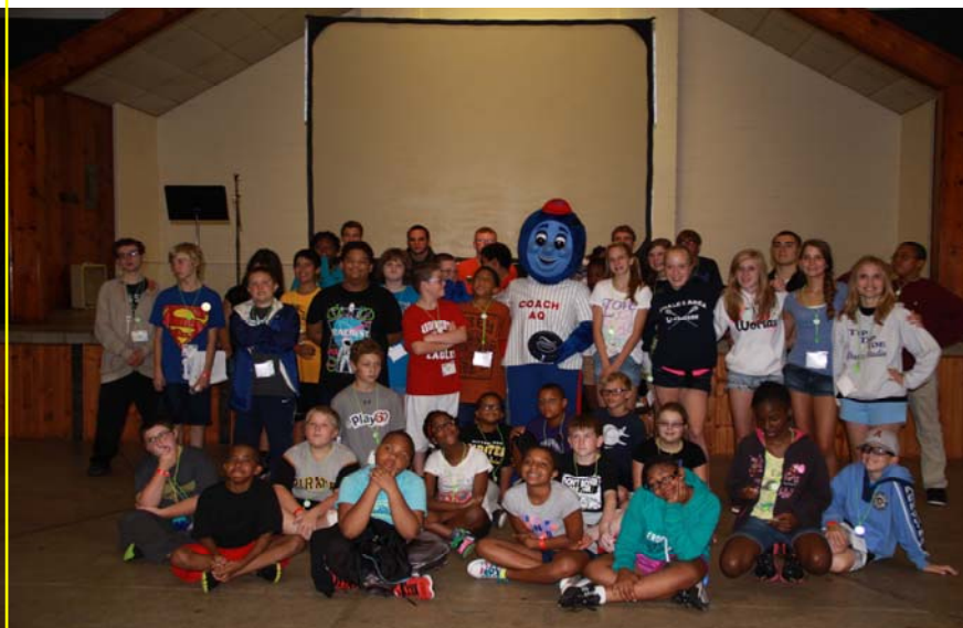
Coach AQ visits Camp Huff and Puff in Jumonville in August.